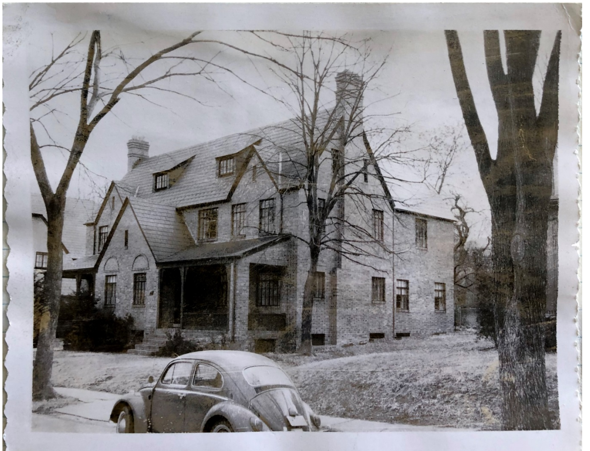
411 Wingate Road (1967)