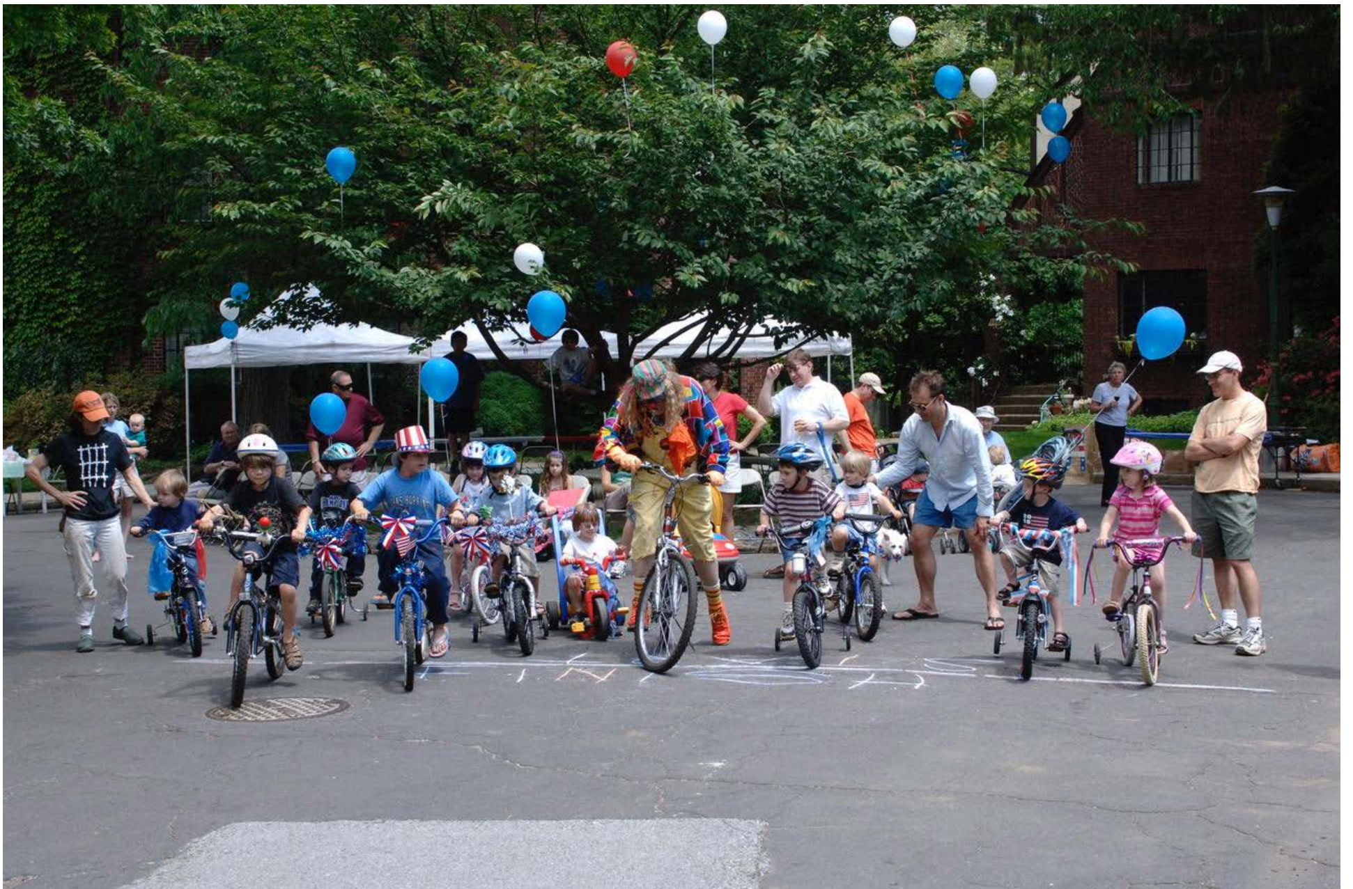
Alonsoville Picnic, 2005