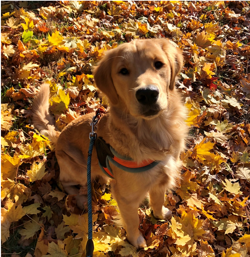
Teddy Bear Pak Golden Retriever 1 year old Loves destroying things.